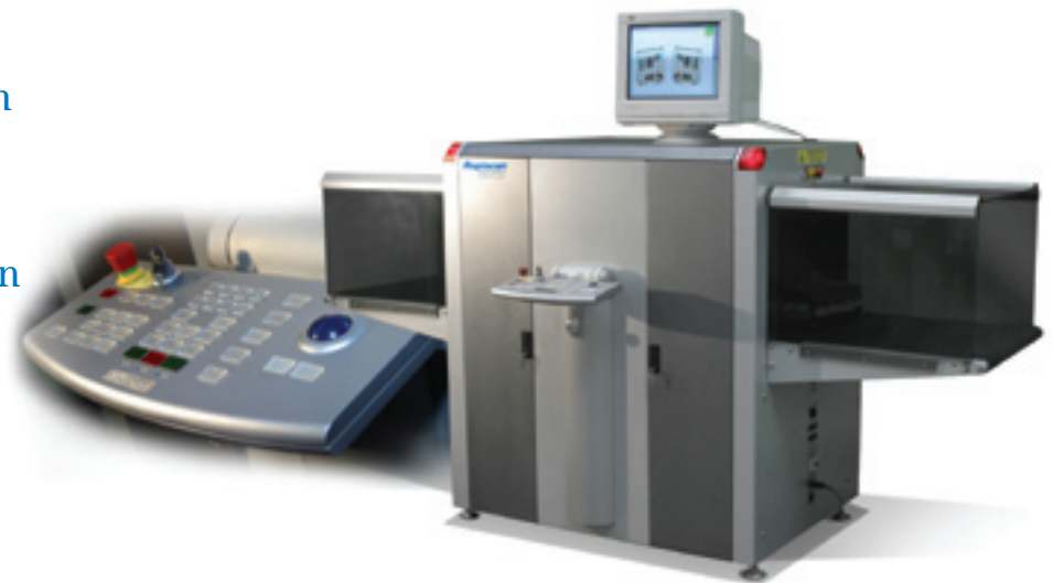
Shown with optional control panel stand

Rapiscan Systems' new OS600 Operating System provides an intuitive Graphical User Interface with improved image quality. OS600 also offers advanced networking capabilities.